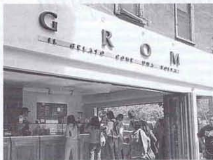
NEW GELATO ON THE BLOCK With the opening of GROM last month, the block of Bleeker Street between Sixth and Seventh Avenues boasts three gelato shops.

Cones's list of flavors includes the standard offerings, plus seasonal and creative ones like corn, maté, Champagne and yogurt. They use no pre-mixes: just milk, cream, sugar and the additional ingredients for a particular flavor. This mixture gets put in a pasteurizer, which warms the base to 180 degrees Fahrenheit and quickly cools it to 39 degrees. The batch then goes in the freezer for 12 minutes. For this artisanal process, Cones won a seal of approval from Slow Food (www.slowfood.com), a "non-profit, eco-gastronomic, member-supported organization that was founded in 1989 to